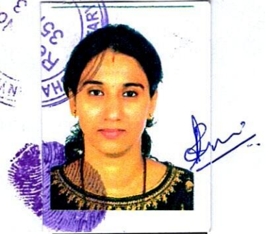
Photo with Signature and Thumb